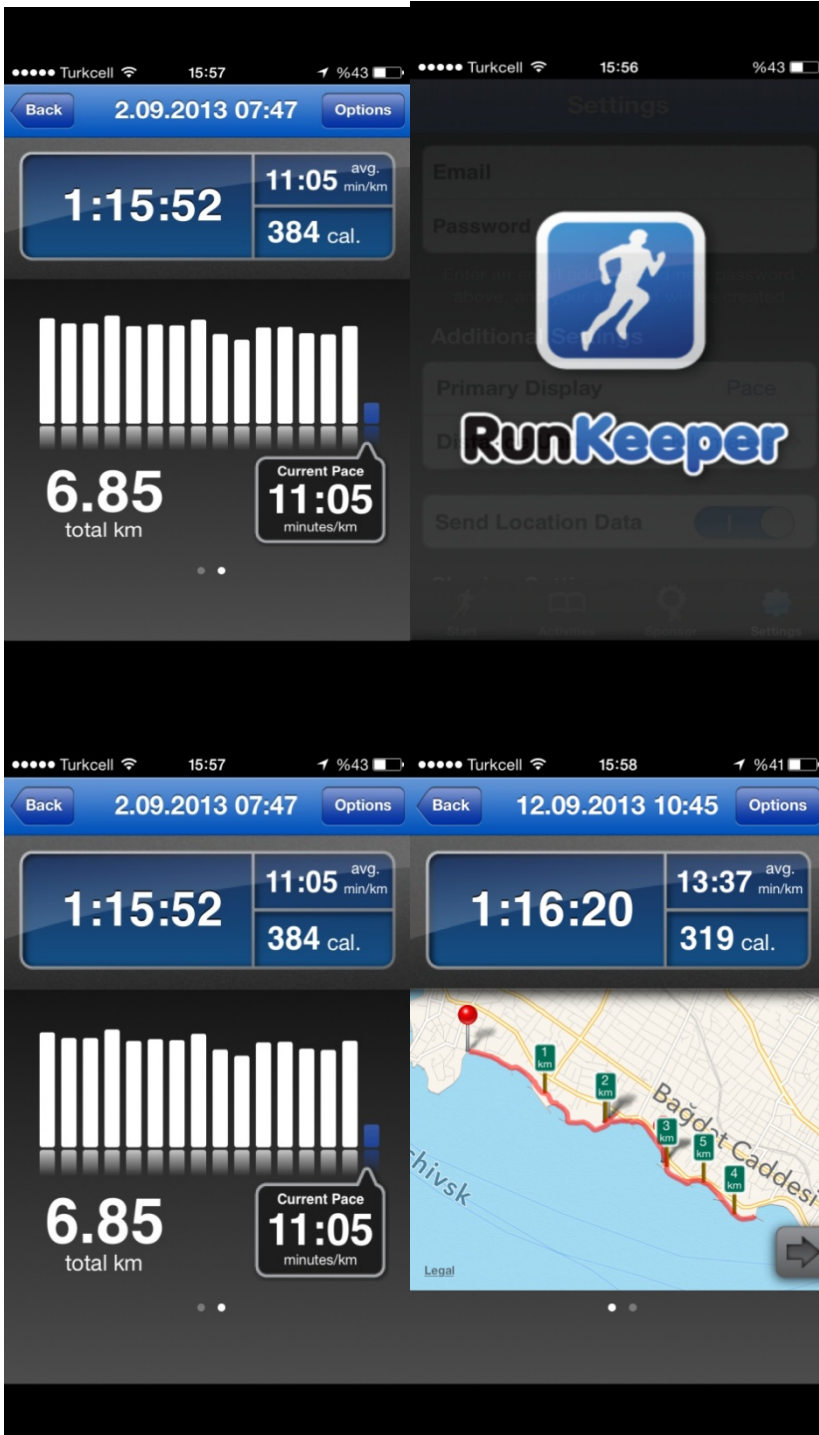
Example 1. Runkeeper