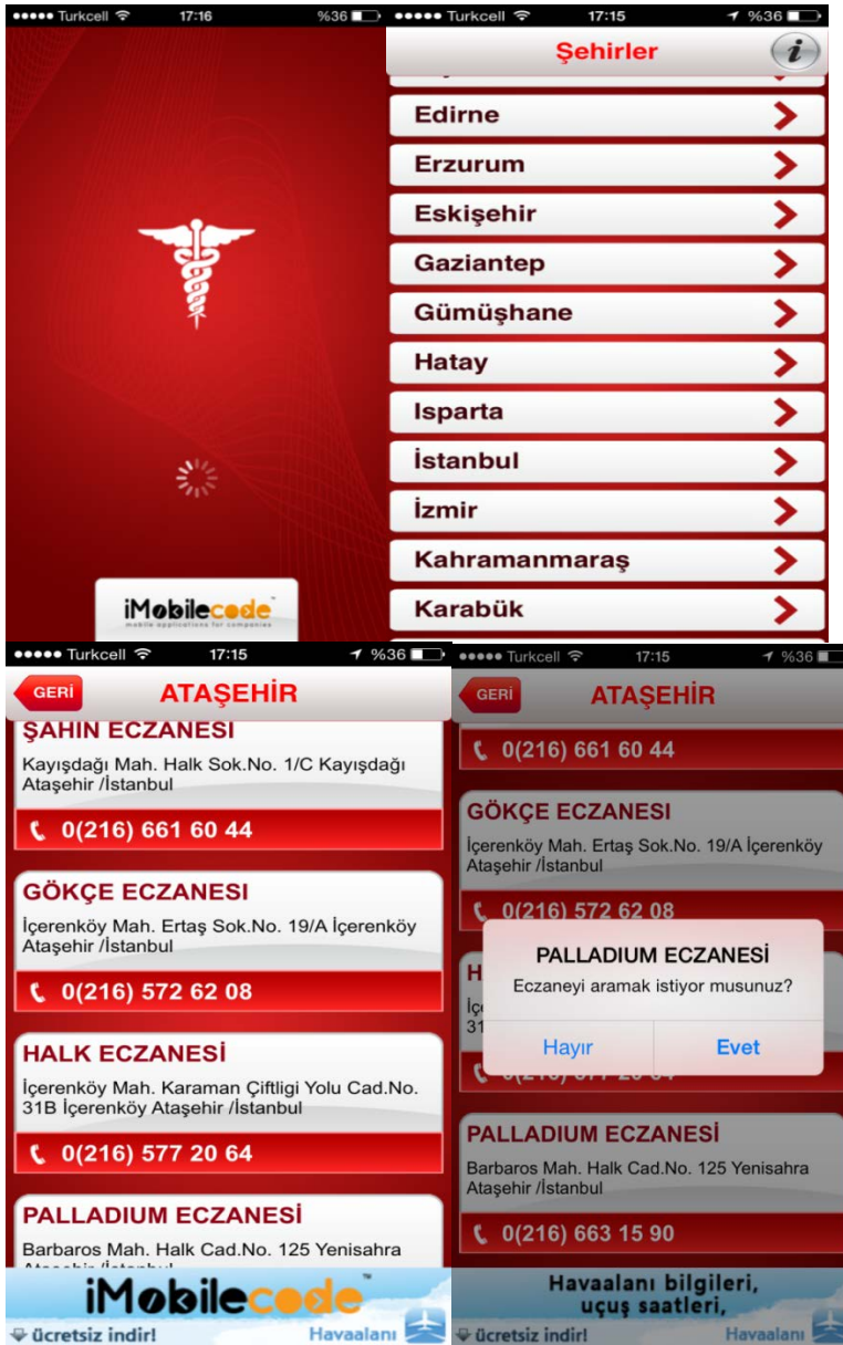
Example 3. Pharmacy

In pharmacy applications, the most practiced applications in the medical category, (example 3), it is possible to find the nearest pharmacy and emergency pharmacies in the provinces and districts by searching. From the most commonly used applications like pharmacy application, "Find a doctor" and "find a hospital" applications are also included.